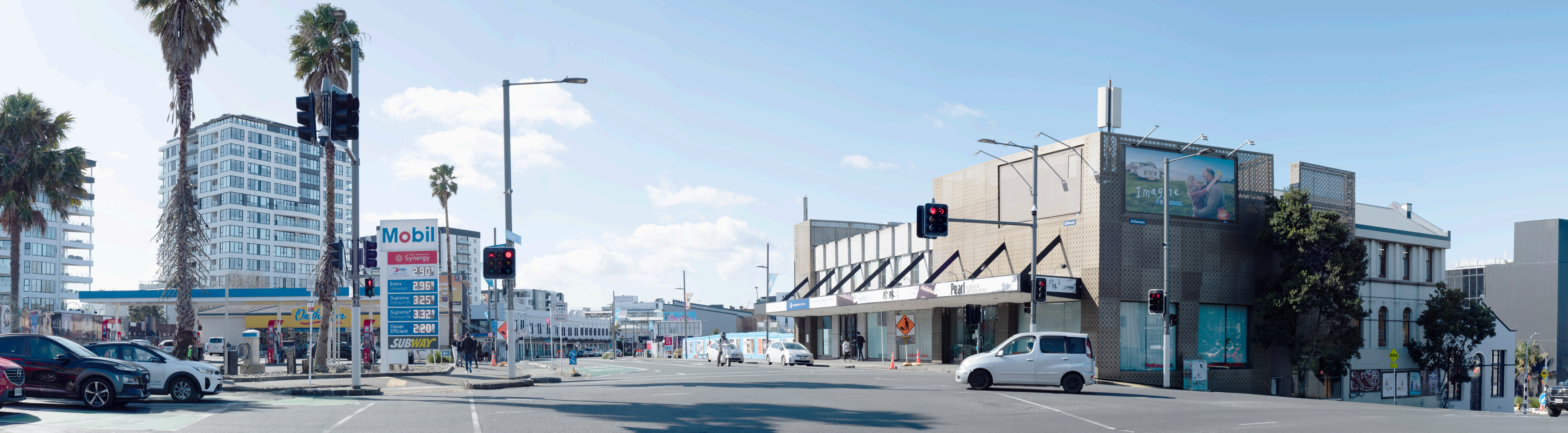
Figure 18. Viewpoint C.

View from the western side of the fourway intersection of Ponsonby Road, Great North Road, Newton Road and Karangahape Road looking northwest towards the site.