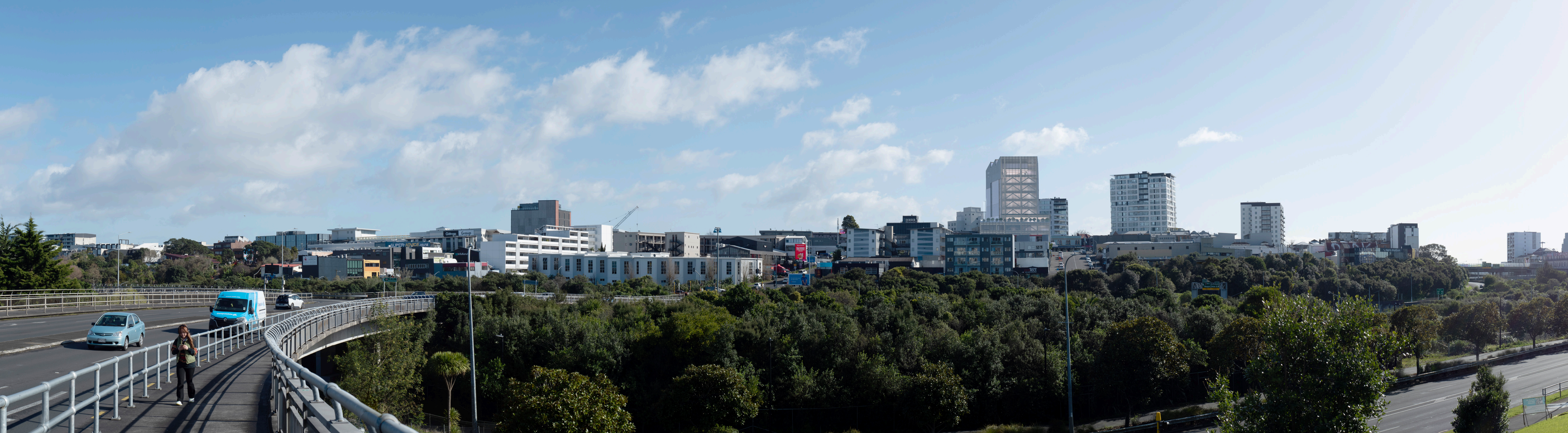
Figure 15. Viewpoint 06 - Proposed.

View from the Newton Road motorway overbridge looking northeast.