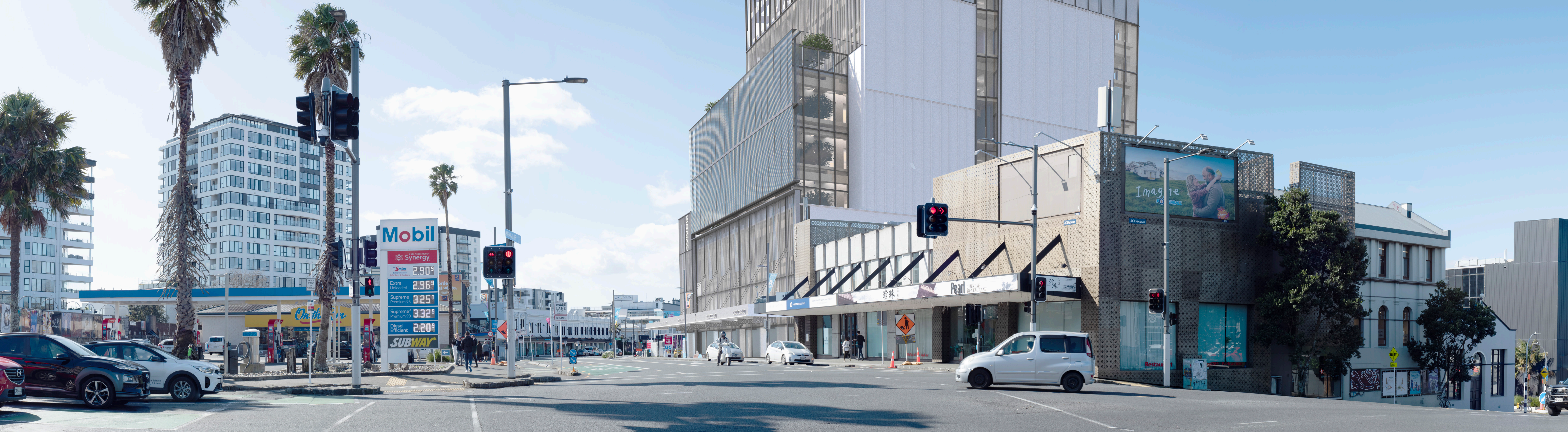
Figure 18a. Viewpoint C - Proposed.

View from the western side of the fourway intersection of Ponsonby Road, Great North Road, Newton Road and Karangahape Road looking northwest towards the site.